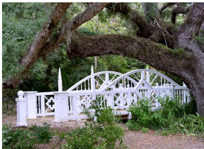
Victorian Bridge Completed – Volunteers have recreated the bridge (above) based on the photo below.

Do you have any information, photos, stories etc. that you would like to share? Contact the Park, or send us an e-mail. We are always interested in these things. If you want to submit original photos we can scan them and return the originals to you.